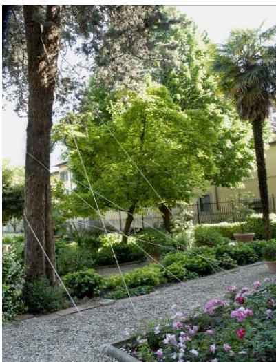
“Spazio Praticabile 2”, National Archeological Museum, Firenze 2007