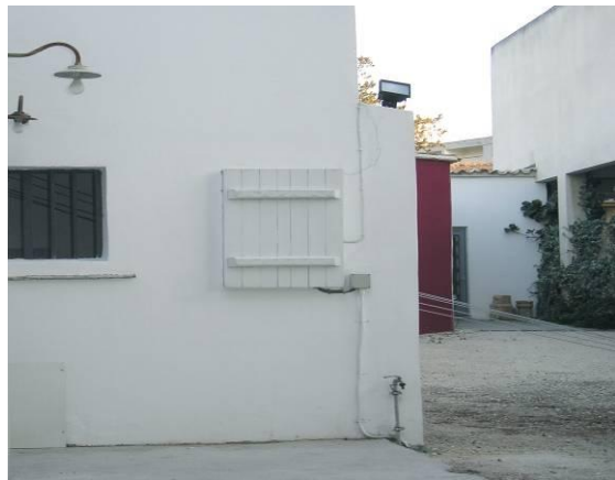
“Passaggi”, Artos Foundation, Nicosia/Cyprus 2006