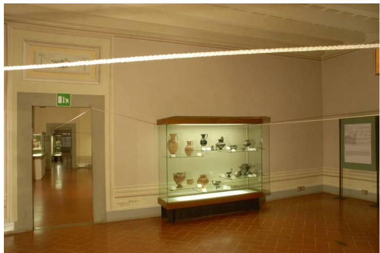
“Il Filo”, National Archeological Museum, Firenze 2007