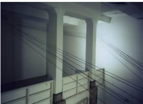
“Chelsea Round”, Chelsea Art Museum, NYC 2002

The others are, in order, “Round”, presented in Heidelberg, New York, Bergamo, Venezia, Lodz , Berndorf/Wien and Firenze, “Passaggi” (The Passages) in Nicosia, “Spazio Praticabile” (Practicable Space) in Prag and Firenze, “Il Filo” (The Thread) in Firenze and soon in Roma and Waiblingen/Stuttgart, and “Da Qui a Li” (From Here to There) in Prag and Budapest.