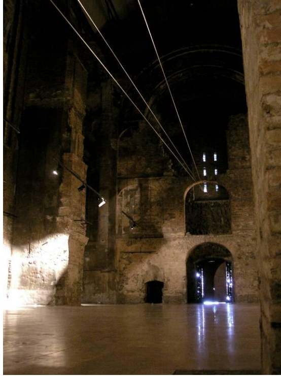
“Da Qui a Lì”, Kiscelli Museum, Budapest 2008

“Measuring the space”, as the others, shows lines tensed from a wall to another wall, directly from the wall the lines go out, directly into the wall go in, individuating a piece of something to show, what in the moment is important to let to see. In all cases is a piece of story dedicated to a space. Lines furrow the space in different shape, the lines representing the mark that every living being leaves in his own passage.