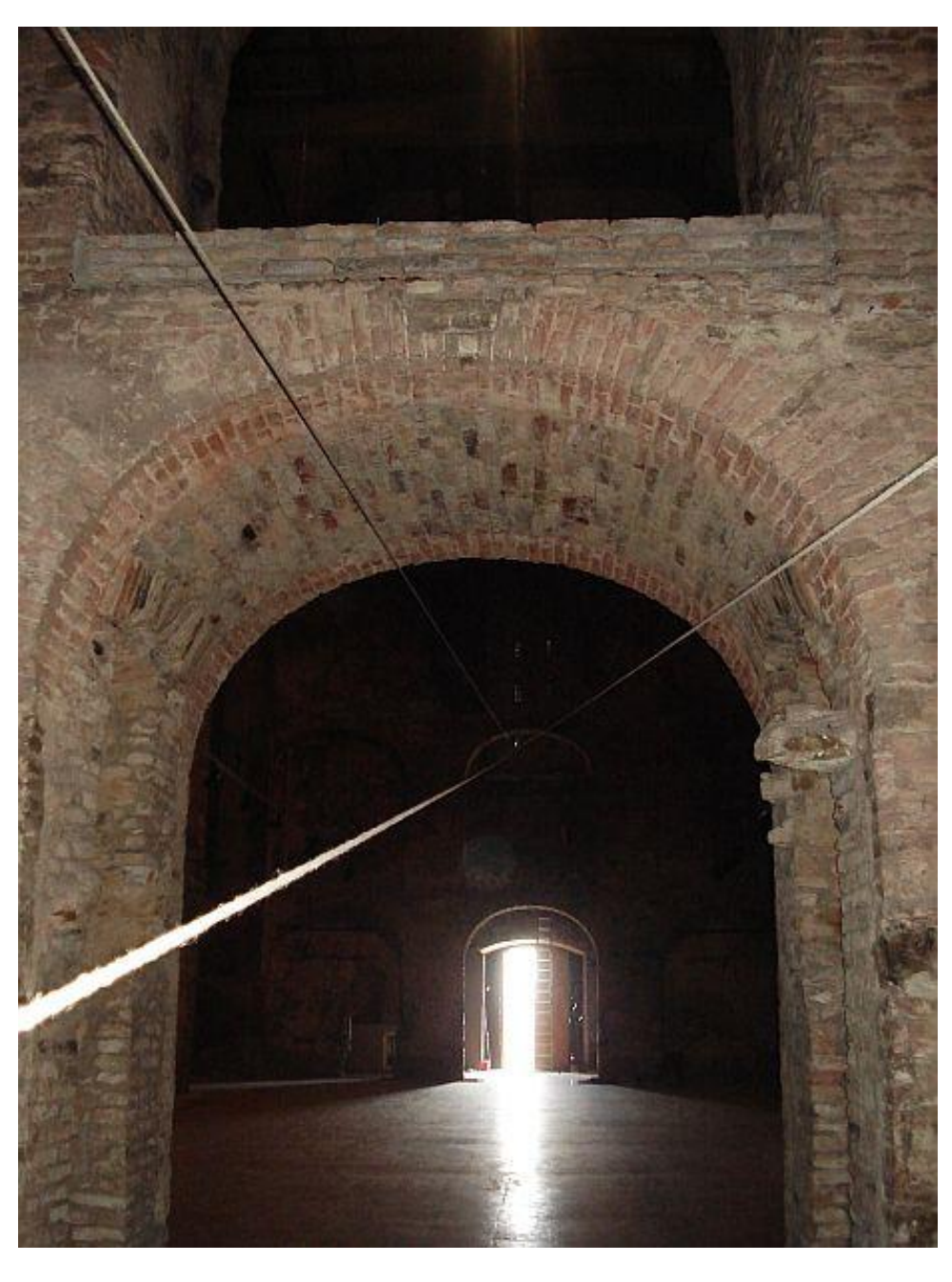
Mimmo Roselli´s installation at Kiscelli Muzeum, Budapest 2008

"My interest has been directed towards large spaces, the 'ground,' distinguished by lightness and transparency; at the same time by stratification and a great richness of details: these spaces are furrowed by signs that cross the canvas like a walk in a vast landscape."